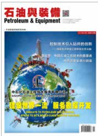
封面 Front Cover

Petroleum & Equipment (Official website: www.shiyouyuzhuangbei.com ) is a professional comprehensive journal of petroleum equipment industry ("Database for Chinese Technical Periodicals" Periodical Full-text, Journals Collected by China Petroleum Literature Databases), The cippe promotional magazine specified. New technology, new arts & crafts, new products and new conceptions of the petroleum & equipment industry are reported in the magazine, which provides an information exchanging platform for petroleum equipment manufacturers and oil producing enterprises. It was published over 30,000 hits per two month, issued bimonthly for public distribution both at home and abroad, printed on full-color copper sextodecimo papers, with main target readers such as top managers, decision makers, technological and purchasing personnel of petroleum & equipment industry, covering oil fields, engineering companies, petrochemical companies, scientific research institutes and equipment manufacturing companies etc. The International Standard Serial Number is ISSN 1001-9960.