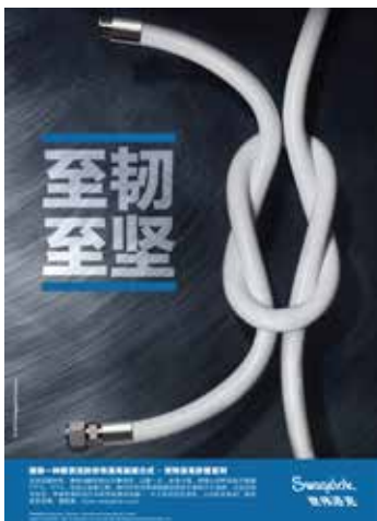
封底 Back Cover