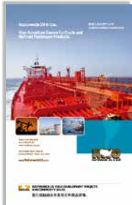
封底 Back Cover