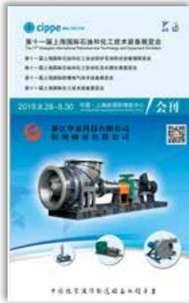
封面 Front Cover