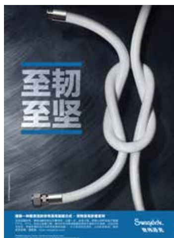
封底 Back Cover