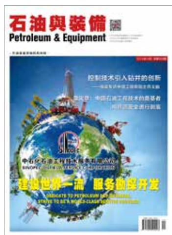
封面 Front Cover

Petroleum & Equipment (Official website: www.shiyouyuzhuangbei.com ) is a professional comprehensive journal of petroleum equipment industry ("Database for Chinese Technical Periodicals" Periodical Full-text, Journals Collected by China Petroleum Literature Databases), The cippe promotional magazine specified. New technology, new arts & crafts, new products and new conceptions of the petroleum & equipment industry are reported in the magazine, which provides an information exchanging platform for petroleum equipment manufacturers and oil producing enterprises. It was published over 30,000 hits per two month, issued bimonthly for public distribution both at home and abroad, printed on full-color copper sextodecimo papers, with main target readers such as top managers, decision makers, technological and purchasing personnel of petroleum & equipment industry, covering oil fields, engineering companies, petrochemical companies, scientific research institutes and equipment manufacturing companies etc. The International Standard Serial Number is ISSN 1001-9960.