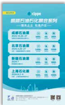
封底 Back Cover