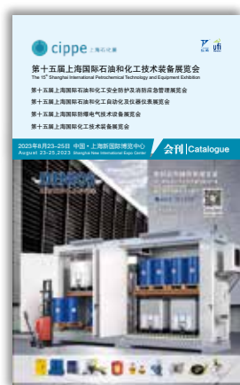
封面 Front Cover